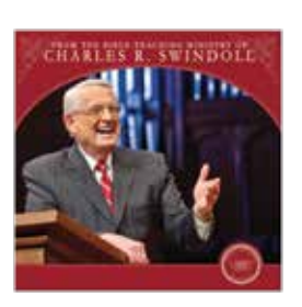
What Every Believer Must Never Forget by Charles R. Swindoll single message on CD