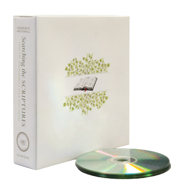
Searching the Scriptures: Find the Nourishment Your Soul Needs by Charles R. Swindoll CD series