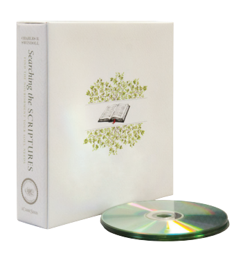
Searching the Scriptures: Find the Nourishment Your Soul Needs by Charles R. Swindoll CD series