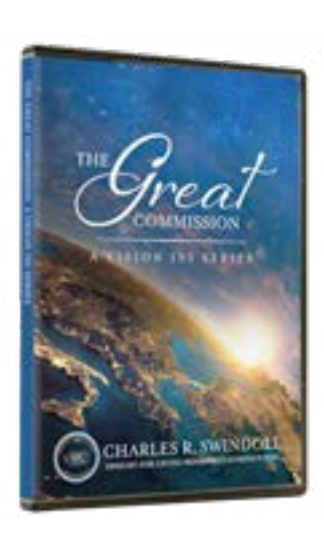
The Great Commission: A Vision 195 Series by Charles R. Swindoll CD series