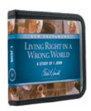
Living Right in a Wrong World by Charles R. Swindoll CD series