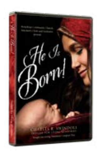
He Is Born by Stonebriar Community Church Choir and Orchestra compact disc