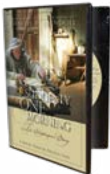
Suddenly One Morning A Radio Theater Production by Charles R. Swindoll single CD