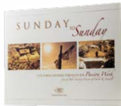
Sunday to Sunday by Charles R. Swindoll and Insight for Living Ministries softcover book

For these and related resources, visit www.insightworld.org/store or call USA 1-800-772-8888 • AUSTRALIA +61 3 9762 6613 • CANADA 1-800-663-7639 • UK +44 1306 640156