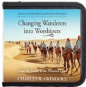
Changing Wanderers into Worshipers: From the Exodus to the Promised Land by Charles R. Swindoll CD series