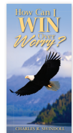
How Can I Win Over Worry? by Charles R. Swindoll booklet