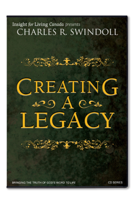
Creating a Legacy by Charles R. Swindoll message series