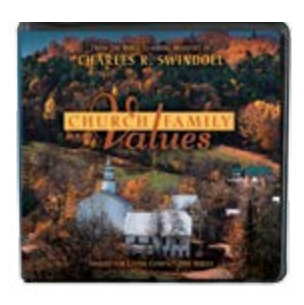
Church Family Values by Charles R. Swindoll CD series