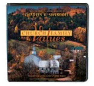
Church Family Values by Charles R. Swindoll CD series