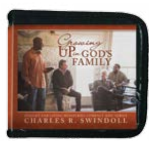
Growing Up in God's Family by Charles R. Swindoll CD series