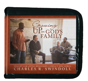
Growing Up in God's Family by Charles R. Swindoll CD series