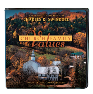
Church Family Values by Charles R. Swindoll CD series